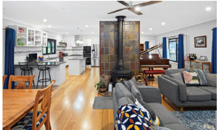
The Stuarts' redesign separated the kitchen from the family area, creating a space for the grand piano.